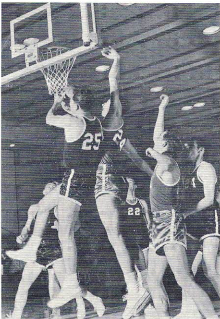
All four classes scramble under the boards!