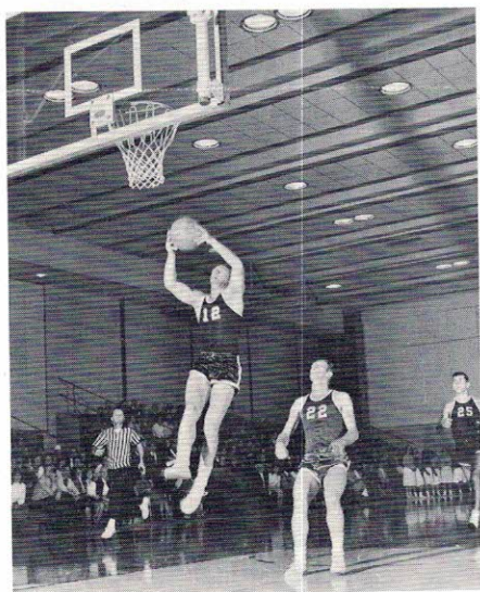
Opening Night: The season begins with fire!

and Saturday nights. Five well-matched, superb teams are slated for the tournament this year. The faculty, perennial favorite, has been bolstered by new talent and seeks to regain its championship, lost last year to the Juniors (this year's seniors). Each class has its